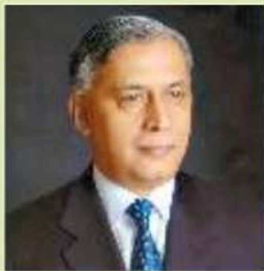
Mr. Shoukat Aziz Ex- Prime Minister Islamic Republic of Pakistan

Sultana Foundation is one of the welfare projects shaping the future of Pakistan. Conventional and unconventional approaches adopted by Sultana Foundation are its unique distinction in the field of education. New programmes of Sultana Foundation, more specifically, 'School less Children' initiative taken by Dr. Naeem Ghani, named as "Quantitative Deficiency in Education" is an important aspect that needs attention from both government and private sector. It is of utmost pleasure that Foundation started its work in 1994 with only two rooms available. Today it has many significant institutes and disciplines, where thousands of students are quenching the thirst of knowledge.