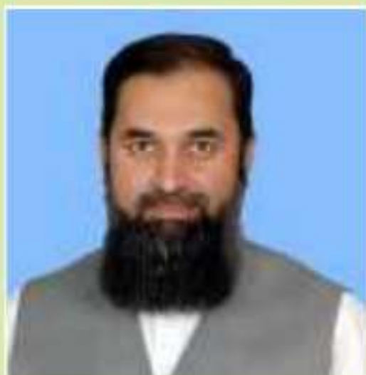
Mr. Muhammad Baligh ur Rehman Federal Minister for Education

Social and non-governmental organizations, like Sultana Foundation, are serving in education health and many other sectors, for common people. I must say that the government institutions should take help from these kinds of institutions. In this reference, I appreciate the efforts of all the concerning persons, who are working for Sultana Foundation.