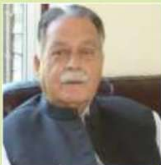
Mr. S. Sikandar Hayat Khan Ex- Prime Minister Azad Jammu Kashmir

I am really happy to know that Sultana Foundation is working for common people. It is producing the infrastructure that would strengthen the society. This is the best example of such highly and appreciable service, started by a group of people. Through this service, we can manage human energy for volume fairy deeds and works for public. I really congratulate the team of Sultana Foundation. They have expressed a true devotion and dedication to work.