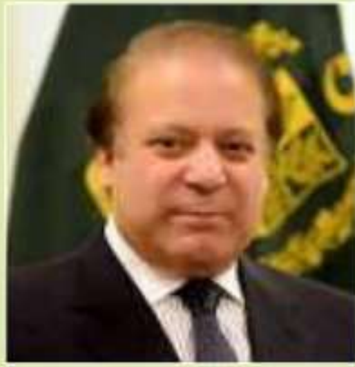
Mr. Muhammad Nawaz Sharif Ex- Prime Minister Islamic Republic of Pakistan